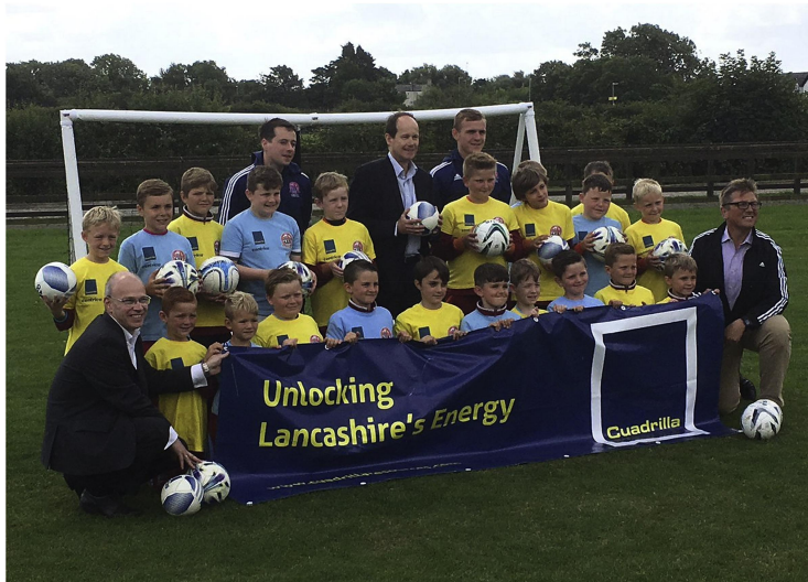
Fig. 3. Cuadrilla's sponsorship (Cuadrilla, 2016).

In terms of community disputes and grievances, are there instances where community leaders or people of influence in the community resolve issues, rather than the local authority or equivalent body?