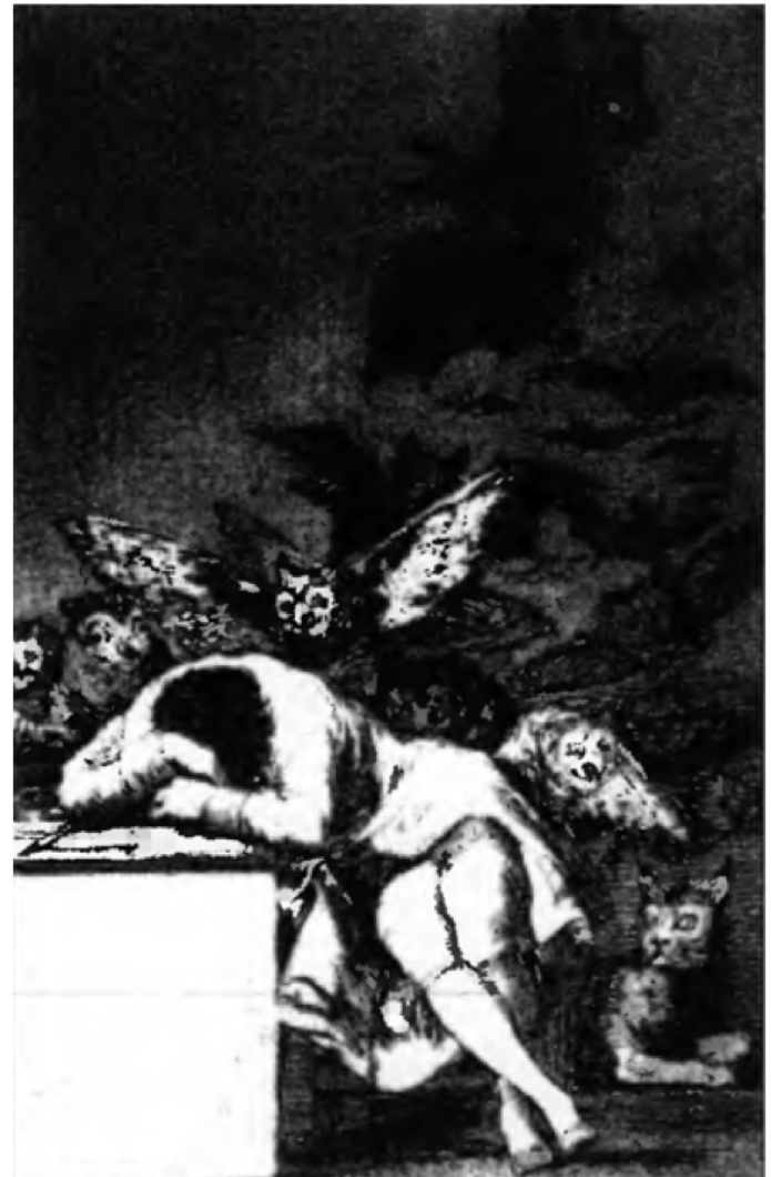
Goya, The Sleep of Reason Produces Monsters . “The spirit of nature is a hidden one, it does not manifest itself in the form of a spirit: it is only a spirit for minds that know it, and it is spirit in itself, but not for itself.”