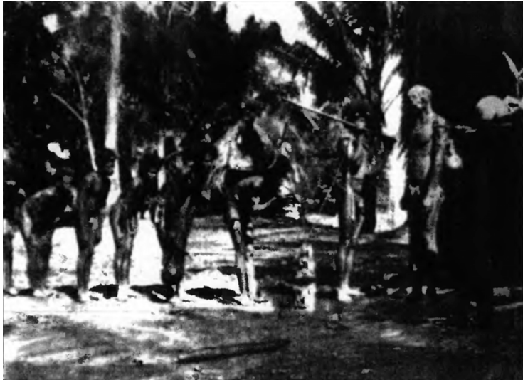
Adam Smith's homo economicus in its natural environment, engaged in financial speculation from the depths of the cave.

There is nothing more false than the notion of barter. All Adam Smith's speculation start from Cook's error regarding the Polynesians, who climbed on board his ship and proposed to the Europeans an exchange, not of objects, but of gifts. The notion of barter – which is supposedly a utilitarian exchange of goods considered as equivalent and in which all would be lacking for it to become commodity exchange would be currency ... – d was born in the 18 th and 19 th centuries, from utilitarianism as we know it. Marcel Mauss gathered together a considerable number of facts dealing with various primitive societies under the head of the concept of the "gift" (cf. His essay, The Gift ), and expressed a few of its universal traits. It now seems that we would hardly be overstepping ourselves to generalize his discovery to all primitive societies. In passing it should be mentioned that all the modern robinsonades start from the same idiotic postulate: to wit, that something called homo economicus lived in caves and on islands – a farce all the more amusing considering that no such species has ever existed, even in the London-style "City," where nonetheless certain cave-dwelling sorcerers called "stock traders" abound.